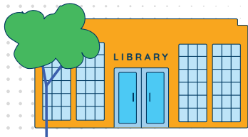
Libraries & Makerspaces