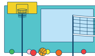
Gyms or Recess